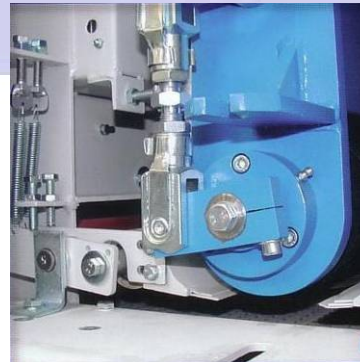
Pressing boards - short work

The company has a policy of continuous product development and improvement, specifications and therefore subject to change without notice. The company does not accept liability for discrepancies in specifications or illustrations contained in its publications.