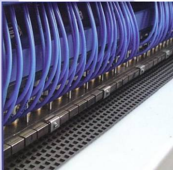
Automatic segmented pad