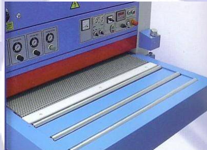
Front and rear table extensions